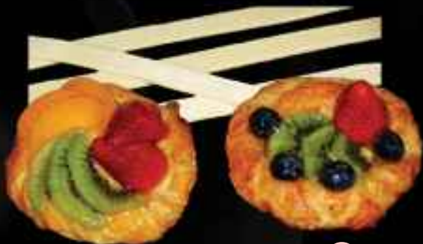
FR257 Danish Stick 60gr ⓘ 丹麥酥條 60gr 50cm x 2.5cm