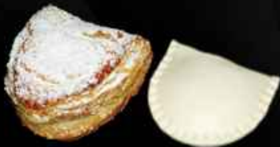
FR213 Large Apple Turnover 140gr 大傳統蘋果酥 140gr ⓘ