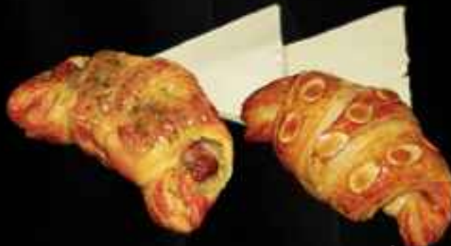
FR258 Butter Croissant Triangle 65gr ⓘ 牛角酥三角形塊 65gr 14cm x 14cm x 13cm