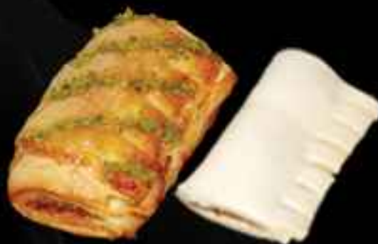
FR210 Large Bear Claw 85gr 大榛子酥 85gr ⓘ