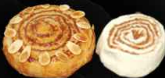
FR215 Large Hazelnut Snail 100gr 大榛子卷 100gr ⓘ