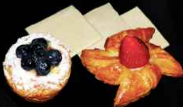
FR255 Mini Danish Square 30gr ⓘ 細丹麥酥方塊 30gr 8cm x 8cm

由純法國牛油製成之急凍麵糰塊已完全發酵,隨時備用。放在室溫解凍,然後造形及烤焙。