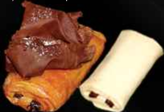
FR201 Large Pain Au Chocolat 90gr 大朱古力酥 90gr ⓘ

由純法國牛油製成之急凍丹麥酥,已發酵及塗上蛋漿,隨時可烘焙。於室溫解凍1小時,放在175 °C-180 °C焗爐內烘焙14-20分鐘(視乎大小而定),不用加蒸氣。