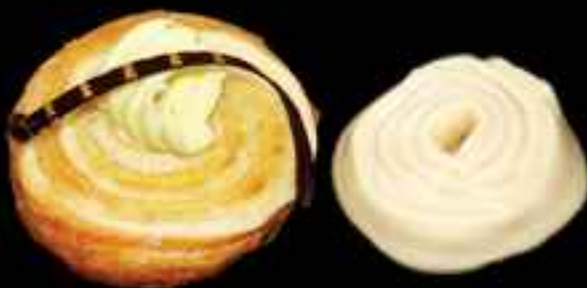
FR239 Large Cream Cheese Snail 90gr ⓘ 大忌廉芝士酥 90gr