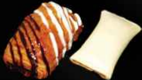
FR252 Large Double Chocolate Fudge Danish 90gr ⓘ 大雙重朱古力醬酥 90gr