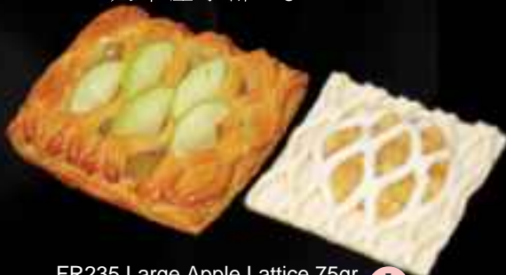
FR235 Large Apple Lattice 75gr 大蘋果酥 75gr ⓘ