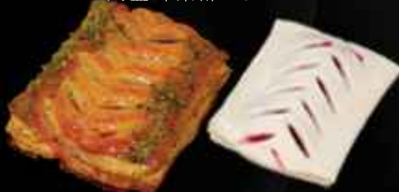
FR237 Large Cranberry Strudel 90gr 大紅莓酥 90gr ⓘ