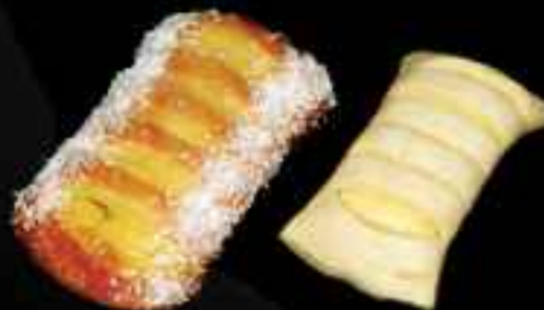
FR270 Large Pain Au Coconut 90gr ⓘ 大椰絲丹麥酥 90gr