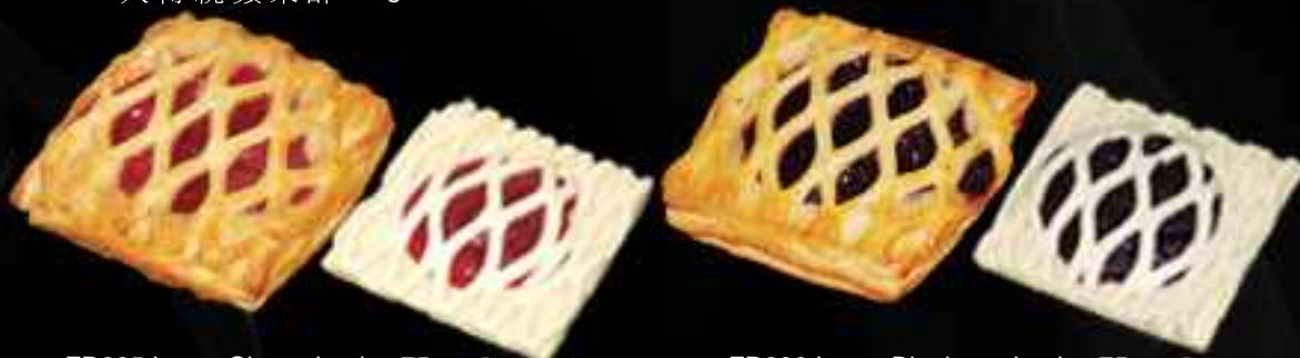
FR225 Large Cherry Lattice 75gr 大車厘子酥 75gr ⓘ