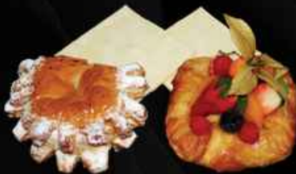
FR256 Large Danish Square 65gr ⓘ 大丹麥酥方塊 65gr 12cm x 12cm