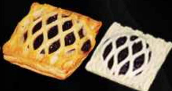
FR230 Large Blueberry Lattice 75gr 大藍啤梨酥 75gr ⓘ