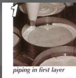
1 piping in first layer