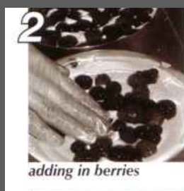
2 adding in berries