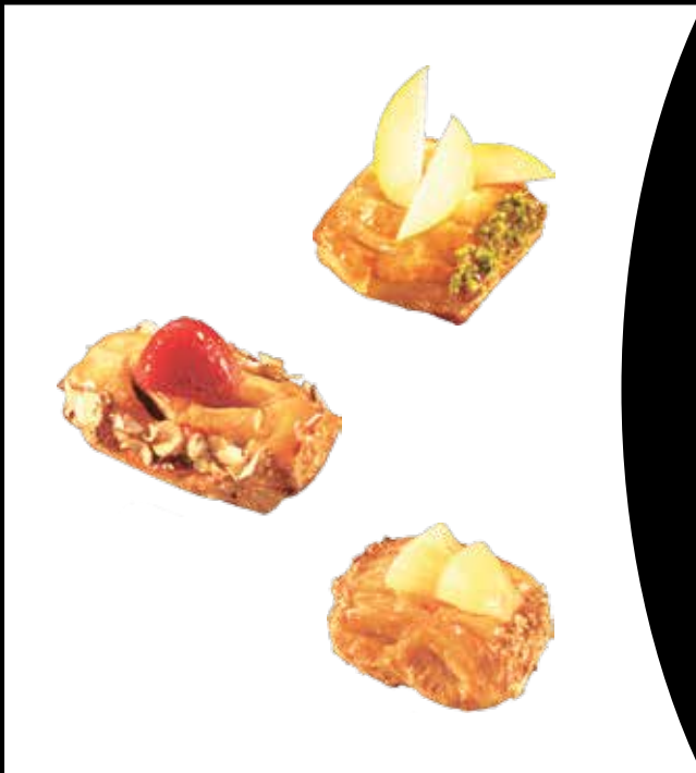
Mini Strawberry Danish 草莓丹麥酥 - 細 30g