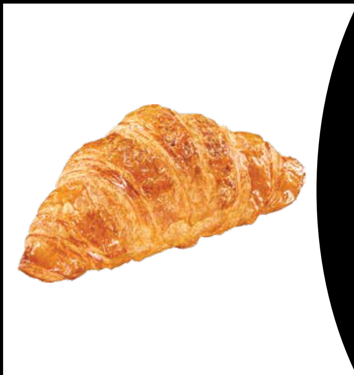
FRC113 AOP French Butter Croissant Straight AOP 法國牛油牛角酥-長形 65g