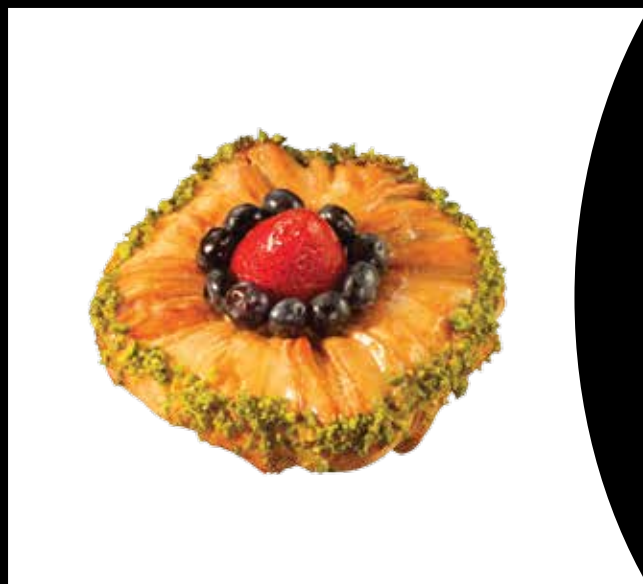
FRD256 Large Danish Square 丹麥酥方塊 -大 12cmx12cm